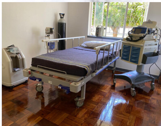
Milton Park COVID-19 Clinic is ready for patients.