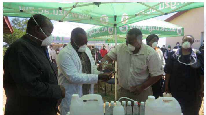
Sanitise your hands, surfaces and frequently used objects.