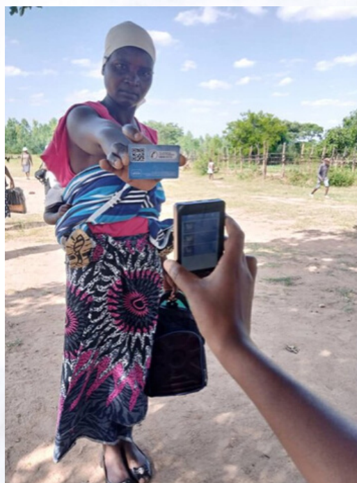
Vulnerable rural community members have been reminded to observe social distancing when receiving aid

In terms of cushioning safety nets, the Social Welfare Department is offering a meager ZWL200 (US$5) per head per month to those identified to be in need against the poverty datum line of US$1.90 per day in an environment defined by skyrocketing prices of basic goods. There are also growing fears that the cushioning allowance is being politicized which means a lot of deserving cases might be missed.