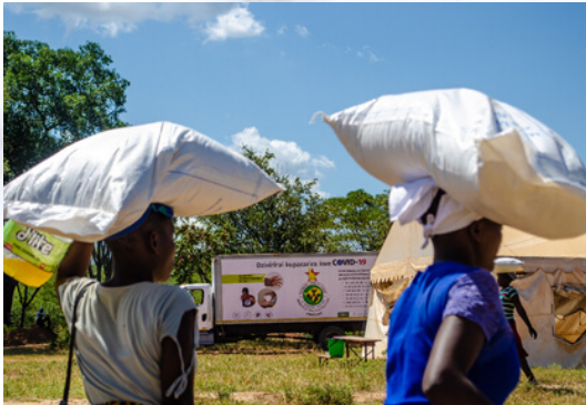
Communities continue to receive food aid during the lockdown

NANGO newsletter documenting COVID-19 outbreak in Zimbabwe.