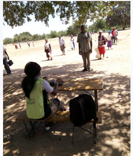
GOAL staff executing their duties while community members queue two meters apart.