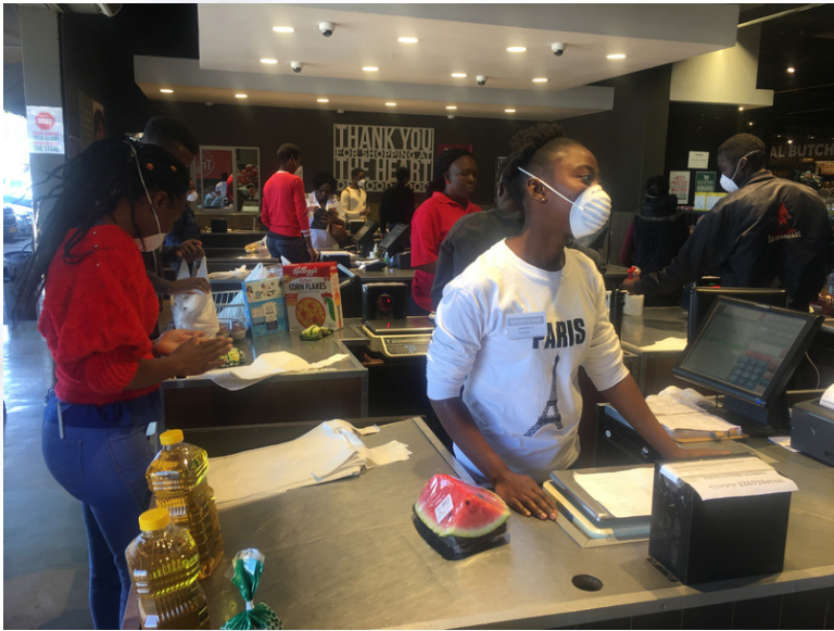
Tellers are commended for wearing masks and using hand sanitisers