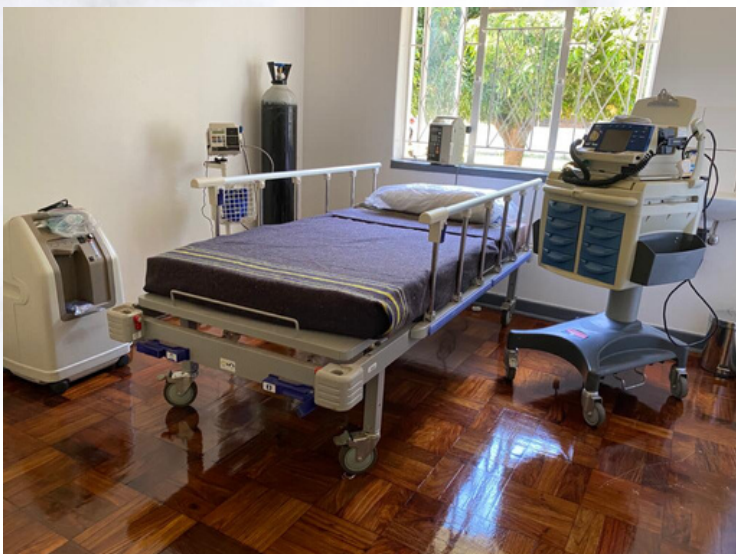
Some COVID-19 Centers are under renovation while some are ready to treat patients showing symptoms of the pandemic.