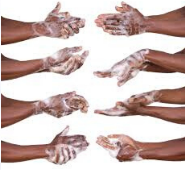
Remember! Wash your hands frequently and thoroughly for at least 20 seconds.