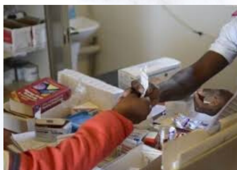
Health care workers should all be provided with masks and gloves.

Hospitals were ill equipped to effectively respond to the pandemic when it first hit Zimbabwe. The country’s COVID-19 response was characterized by low testing coverage because of lack of adequate equipment and commodities and a dissatisfied health care workforce. Access to medical services for non COVID-19 related illnesses has become a challenge since most of the scarce resources are channeled towards the pandemic. There have been reports of challenges to access maternal health services and Anti-Retroviral drugs for those on ART among others. The Malaria outbreak has seen to over 170000 cases representing a staggering 44.7% increase for the period April 2019. In the same period, the number of deaths increased by 20.4%. At the base of it is the slow response and uncertainties among health care workers as they fear attending to these cases since Malaria symptoms are similar to those of COVID-19.