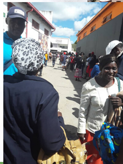
Left: As the lockdown continues Zvishavane residents come out to queue for basic commodities. It's proving to be difficult to maintain social distancing where people have to scrounge to get into queues.