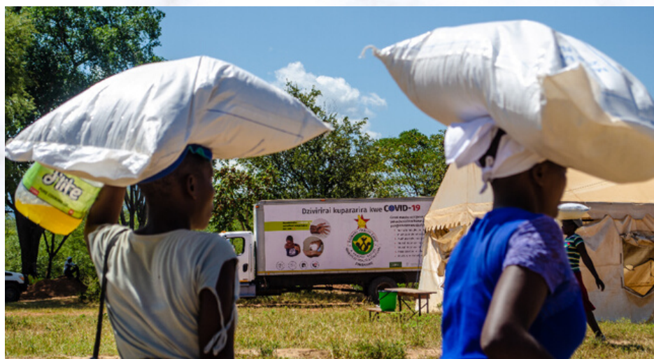
NGOs continue to compliment government efforts.