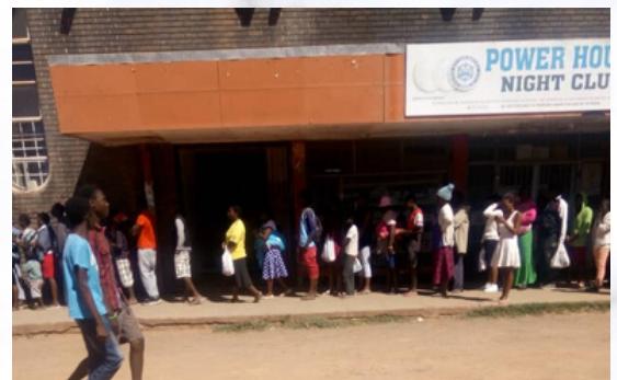
Top: Gweru urban residents queuing to restock basic commodities after the lockdown was extended.