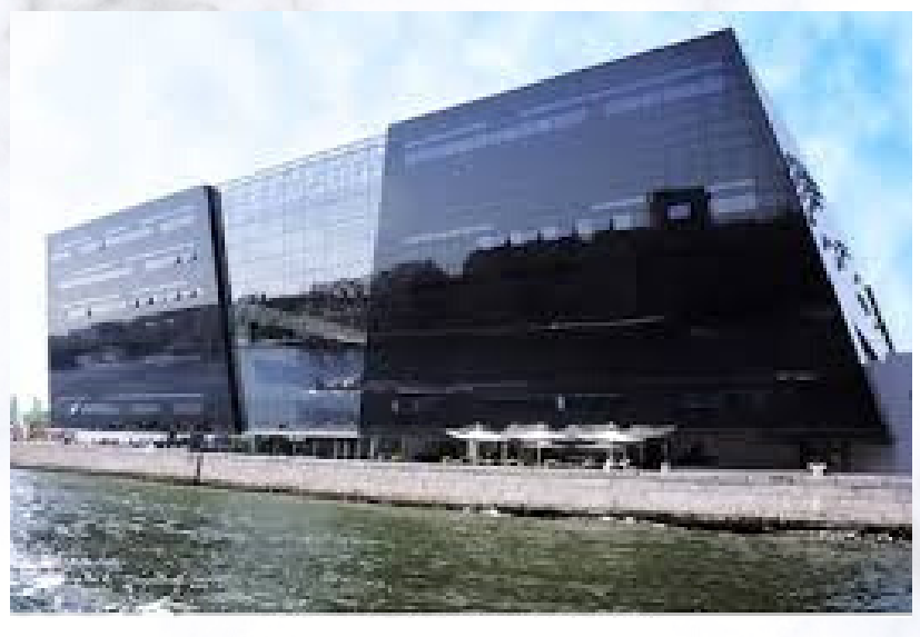
Black Granite mined in Mutoko built part of the $82 million Royal Danish Library in Copenhagen, Denmark.