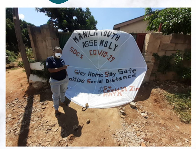
CSOs in Mutare are conducting awareness raising, promoting urgent reporting of domestic abuse and donating food and toiletries vulnerable community members and inmates.