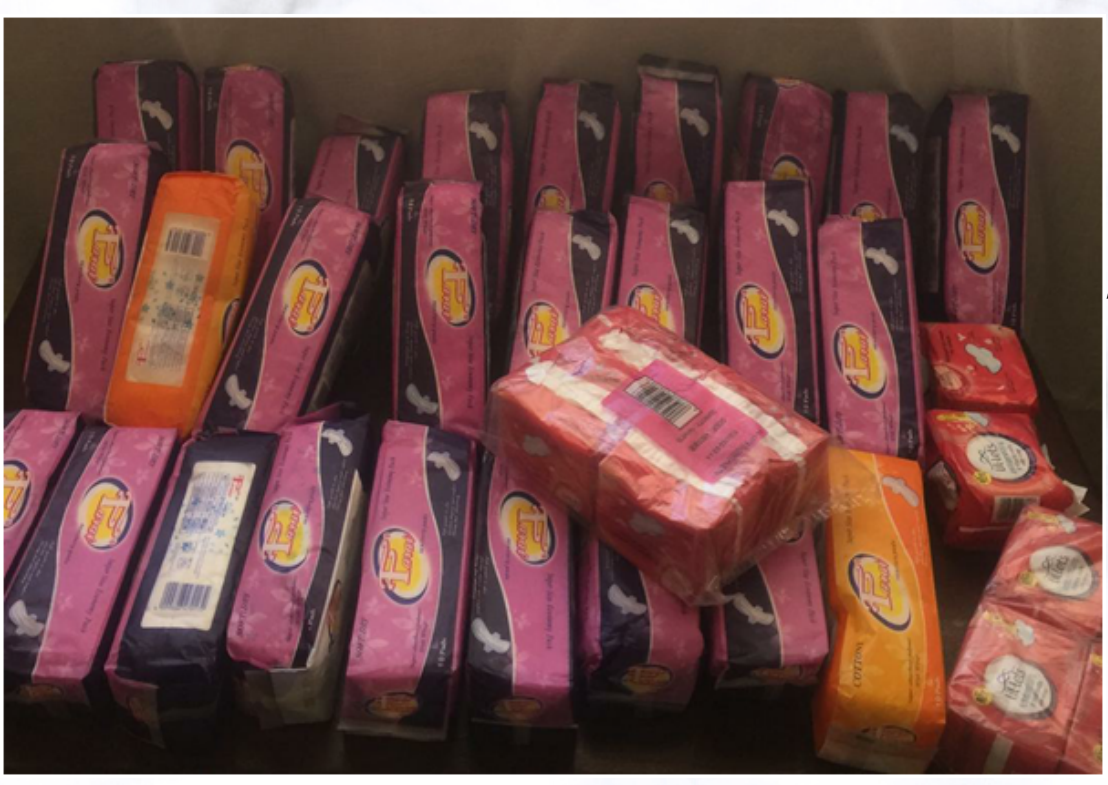
Support a worthy cause by donating towards betterment of girls and women .

Shamwari Yemwanasikana is still appealing to more individuals and institutions to donate in order to reach out to more girls—even after the lockdown is lifted.